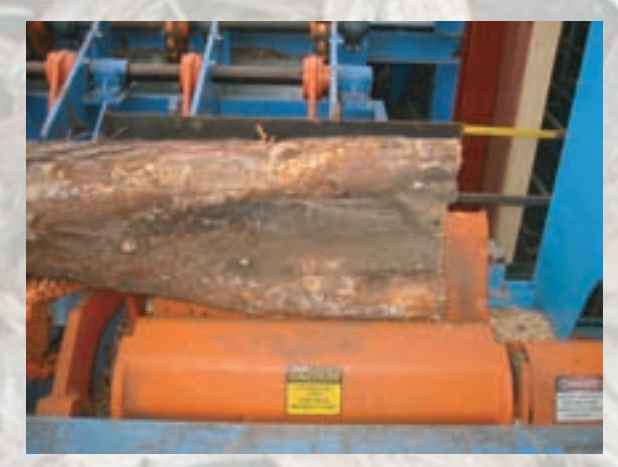
Go from this...