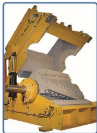
CBI Grizzly Mill

For emergencies, please call our 24-hour emergency number: 604.813.3394