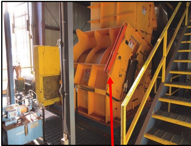
Orange safety bar