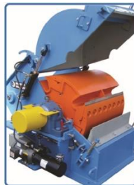
Drop Feed Chipper