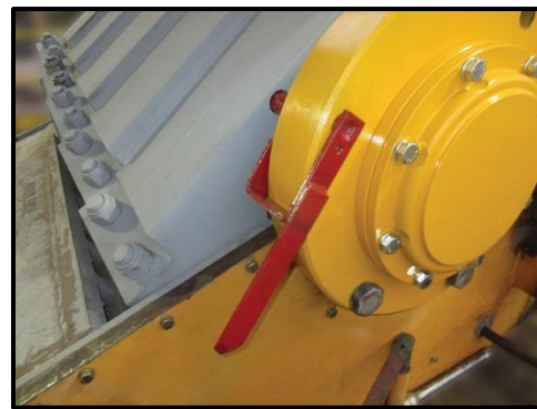
Lock pin — correct position