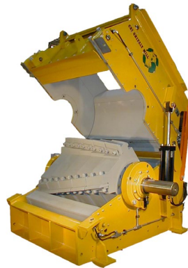
Grizzly Mill Hog