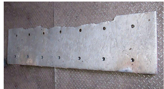
WORN Bottom Anvil Liner